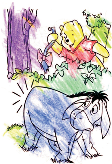
Figure 3. Ani's Coloring at 3 Weeks of HBOT