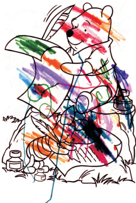
Figure 2. Ani's Coloring after 1 Week of HBOT