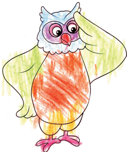
Figure 5. Ani's Coloring after 6 Months of HBOT